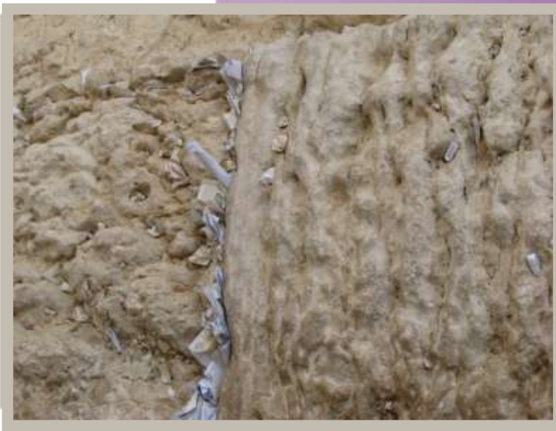
Pictured above: Prayer requests from around the world are placed in the Wailing Wall