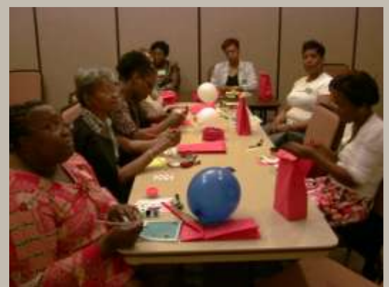
Baptist Women are invited to the Refresh Her Women's Retreat on Saturday, May 14. Pictured on the right are participants from last year's Refresh Her activities.