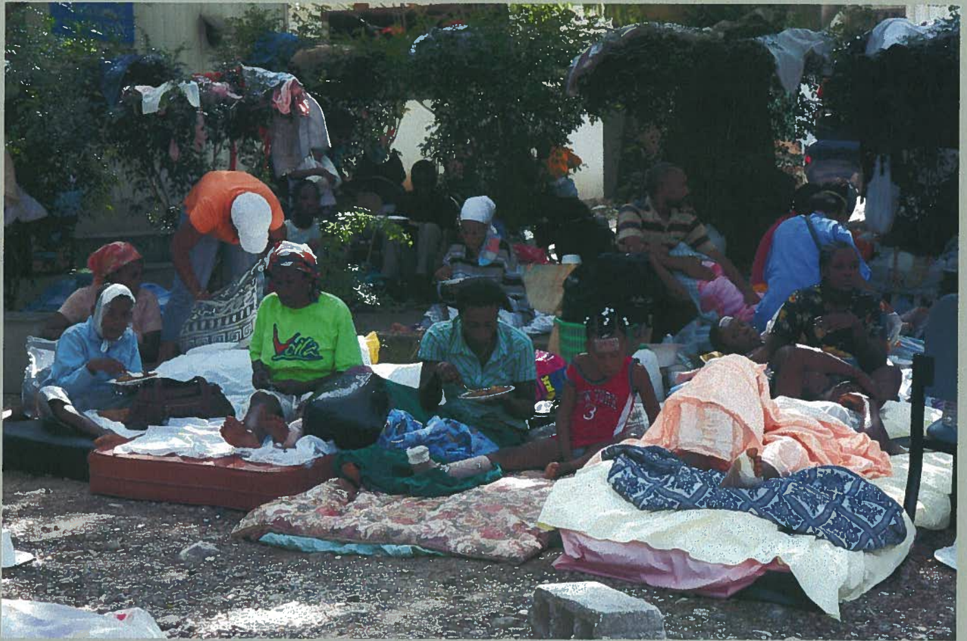
Earthquake survivors receive food and emergency care from the Baptist World Aid Rescue 24 Team